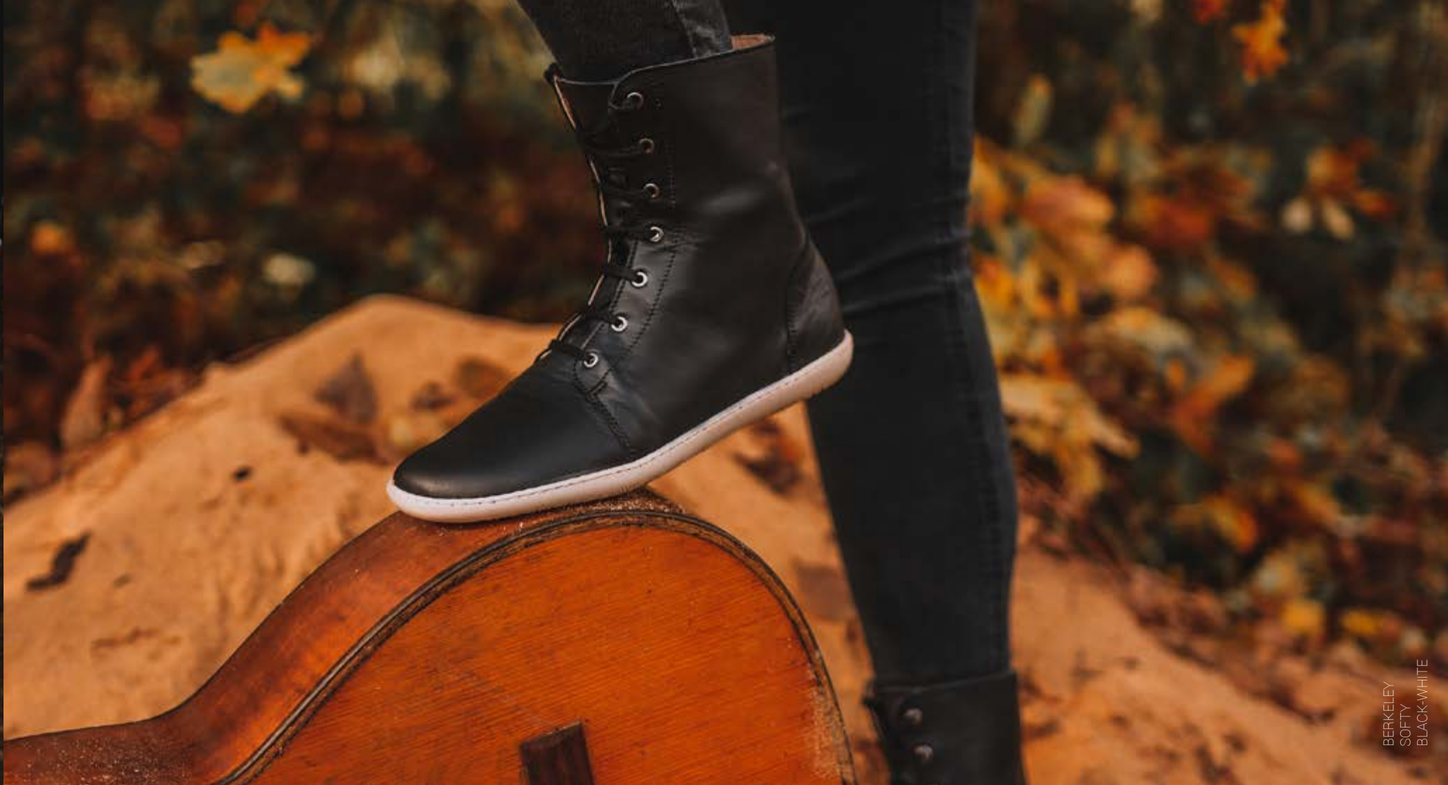
BERKELEY SOFTY BLACK-WHITE